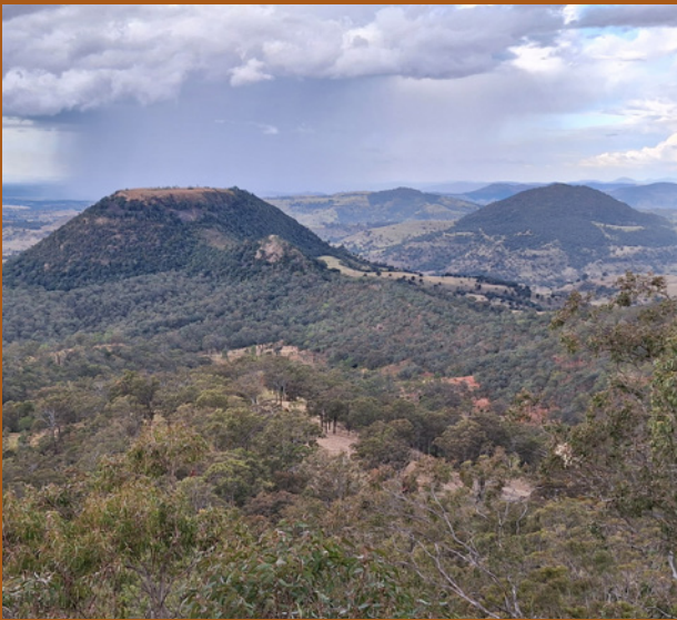
Table Top Mountain (25km)

A Toowoomba icon, this 2-km return hike (35 minutes from Meringandan) leads to a flat summit with 360-degree views of the Lockyer Valley. A moderate climb with rewarding vistas, it's a must-visit for active families.